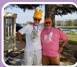
THE BIG CHEESE WINNER 2021!